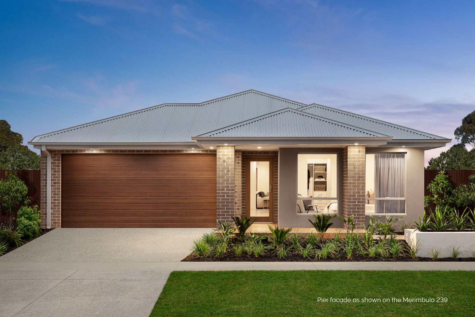
Pier facade as shown on the Merimbula 239