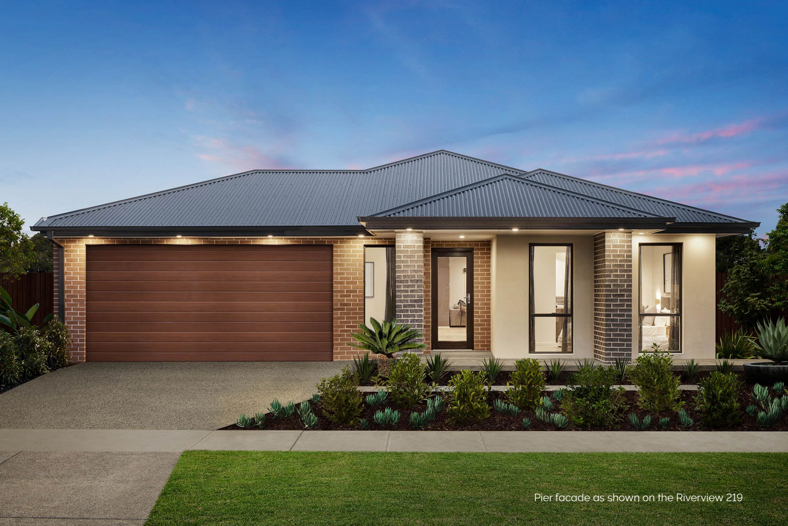
Pier facade as shown on the Riverview 219