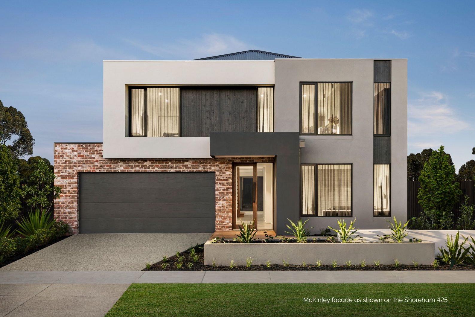
McKinley facade as shown on the Shoreham 425